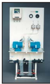
Capital Controls® Models T70G4000 & T70GD4000 Chlorine Dioxide Generators