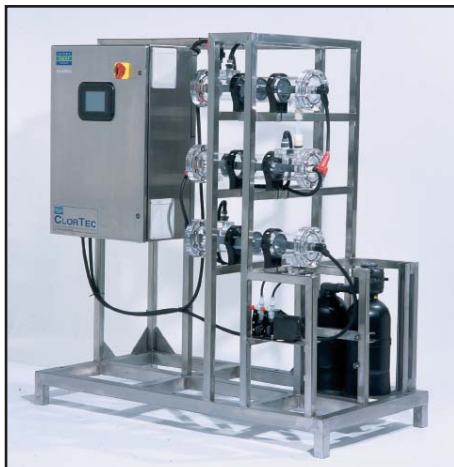
ClorTec™ Component and Skid Mounted Systems 6 - 300 lb/day