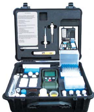
Eclox™ - Portable Water Quality Assessment Systems