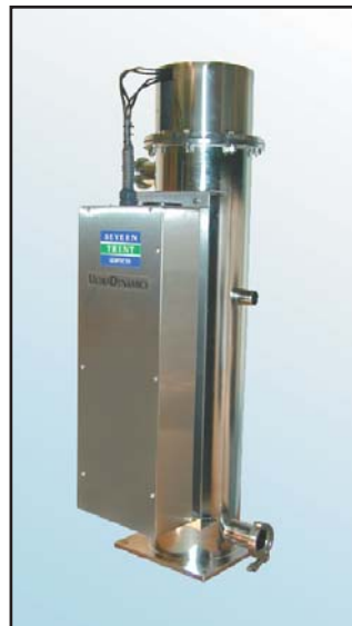
UltraDynamics® Series 8102-VM UV System Vertical Closed Vessel