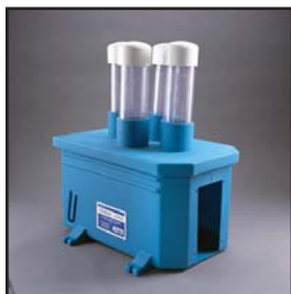
Aquaward® Sanuril® D-Chlor™ - Erosion Tablet Feeders and Tablets