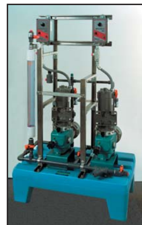
PDS™ Chemical Feed Systems