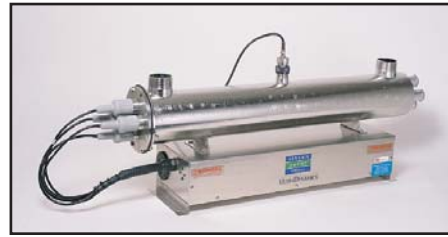
UltraDynamics® Series 8102 Industrial/Commercial Ultraviolet Disinfection Systems Ranging from 2-3,000 GPM (7.6 - 11,356 l/m)