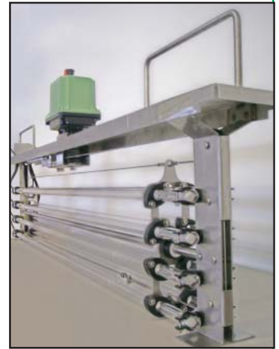
UltraDynamics® Series 8200 Open Channel Horizontal & Vertical Wastewater Ultraviolet Disinfection Systems