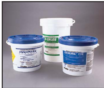
Aquaward® Sanuril® D-Chlor™ - Erosion Tablet Feeders and Tablets