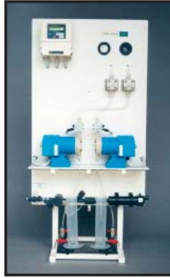
Capital Controls® Models T70G4000 & T70GD4000 Chlorine Dioxide Generators