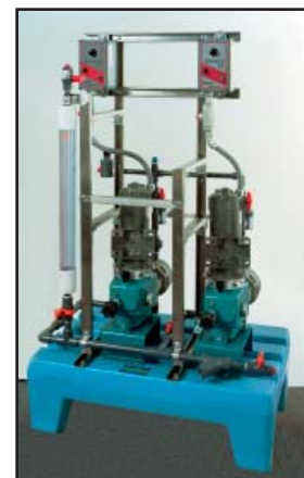
PDS™ Chemical Feed Systems